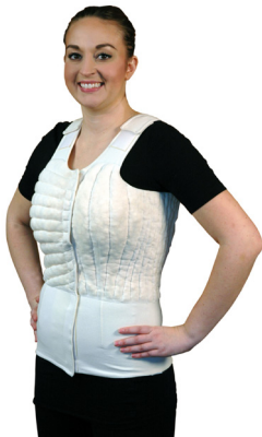
Vest with with optional Full Padding (shown with vertical & horizontal padding options for illustration)