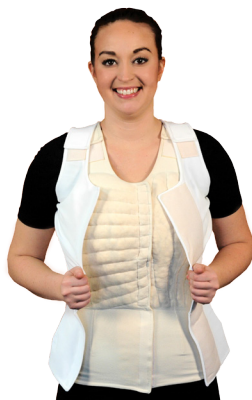
Vest with recommended JoViJacket